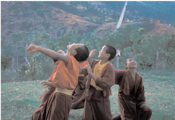
Bhutan Monks Kids

A varied collection of his photographs now hang in the Brooklyn