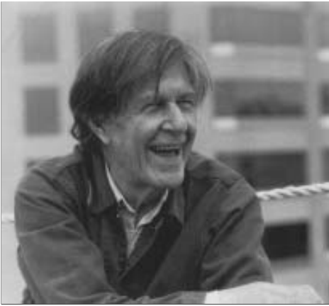
John Cage, 1987

Enclosed is my contribution of $_____. Suggested donation: $30. Please make payable to: Brooklyn College Member Organization (memo ISAM) All contributions are tax-deductible.