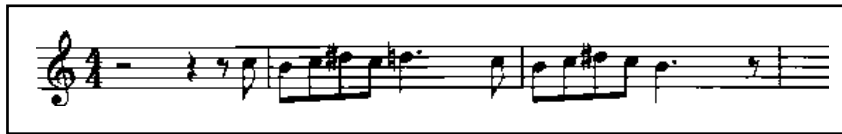
Melodic motive from “React” (Erick Sermon/Just Blaze)

Whateva’ she said, then I’m that If this here rocks to y’all, then react (repeat)