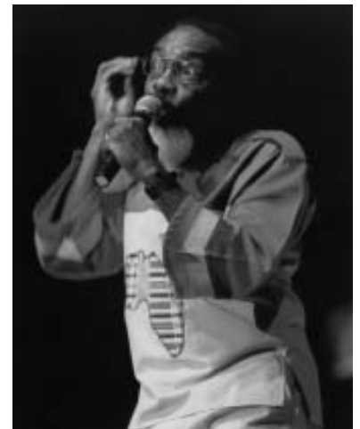
Hollis "Chalkdust" Liverpool

The online and traveling exhibitions are organized by the Historical Museum of Southern Florida.