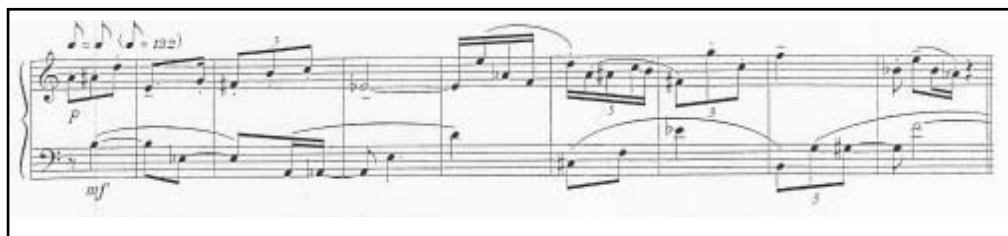
Beyer, "Dissonant Counterpoint," mm. 1-9 Courtesy of Frog Peak Music