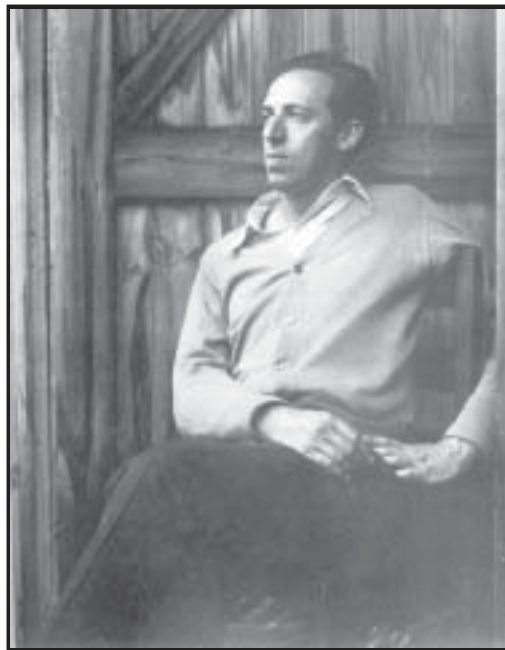
Aaron Copland, 1933