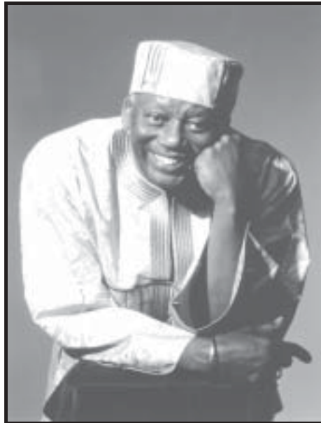
Randy Weston

Weston credits the sounds of Duke Ellington and Count Basie with shaping his musical approach, but Thelonious Monk was his major early influence. Weston recalls informal lessons at Monk's apartment, where he and often a few fellow musicians would gather to sit wordlessly and listen to the master play for hours on end.