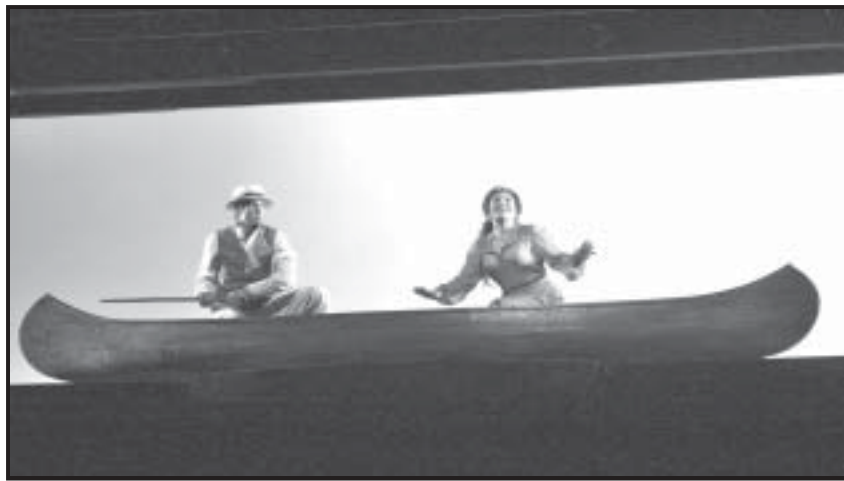
Nathan Gunn as Clyde and Patricia Racelle as Roberta in Tobias Picker's An American Tragedy