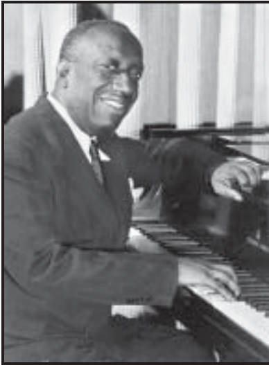
James P. Johnson, circa 1945