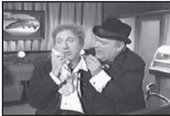
Gene Wilder and Zero Mostel in The Producers (1968)

Brooks, at least, carefully emphasizes the supportive and positive aspect of the Black-Jewish bond. In History of the World , he casts Gregory Hines as a slave for sale in a Roman market who attempts to save himself from the Coliseum first by