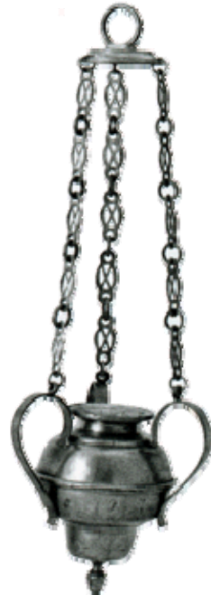
The Eternal Light (Ner Tamid)